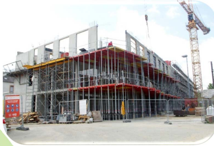
Campus de l'EIDE Adress to be defined

S1FR1, S1FR2, S1EN1, S2FR1, S2FR2, S2EN1, VP1+2, ACCU