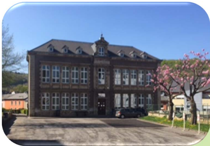
Ancienne École ménagère 2, rue de la Montagne L-4630 Differdange